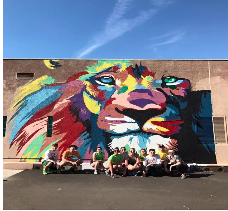
Compton, CA - Emmanuel Reformed Church

Team members partner with Emmanuel Reformed Church, Paramount, California which founded the Compton Initiative, a 40-year commitment to investing in their neighboring city of Compton known too well for gang activity and violence. Students come alongside the ministry to improve the city's image and inspire residents to reclaim their neighborhoods by cleaning, repairing and painting facilities in the community. In the past, students have painted a mural at a school, volunteered at an afterschool program, and helped at a food pantry and served a meal at the Salvation Army.